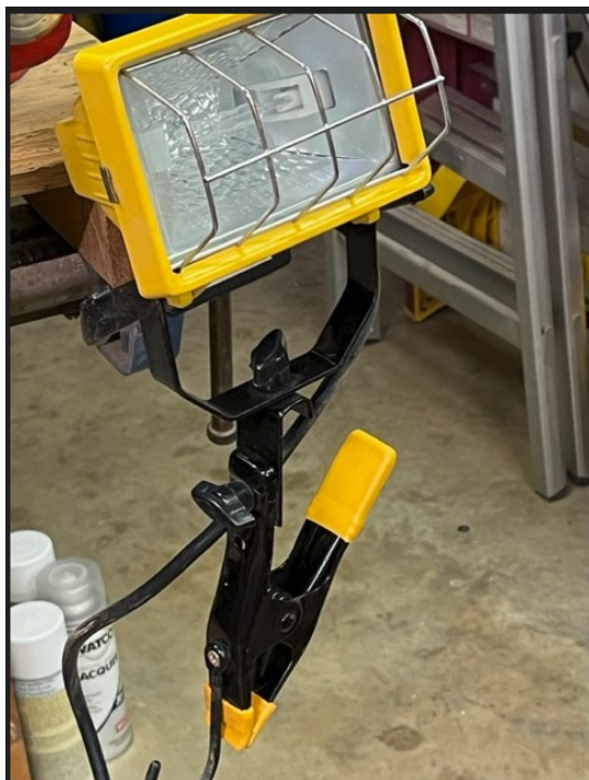
Single lamp, clamp or hang. $5