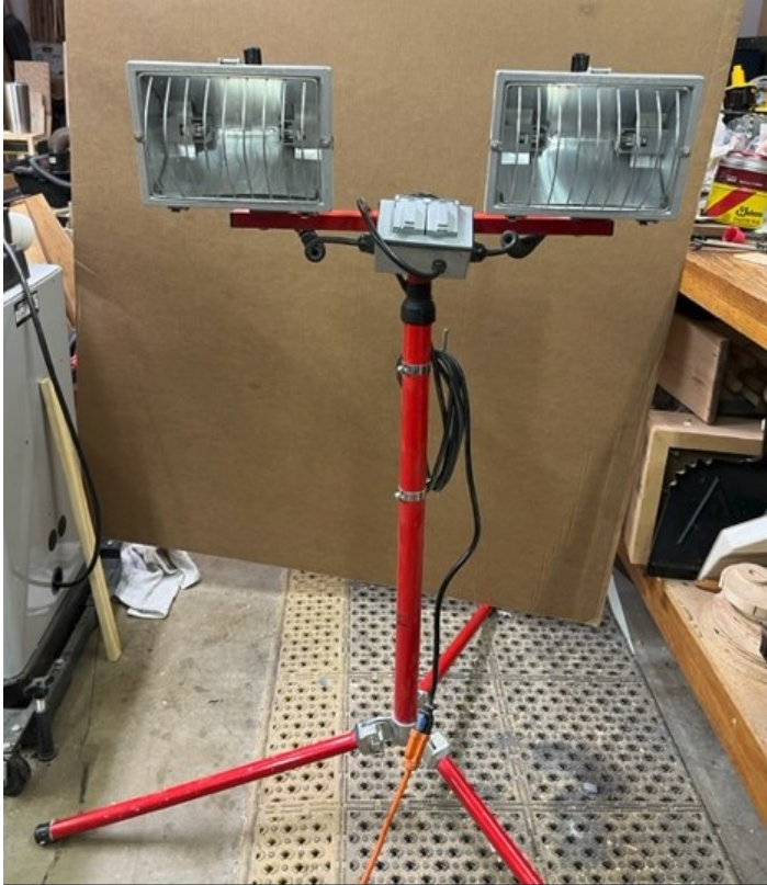
Tripod Dual halogen work light, sturdy, bright, individual switches. $25