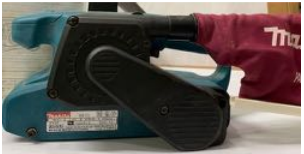
Makita 3x21 Belt sander, like new, in box $40