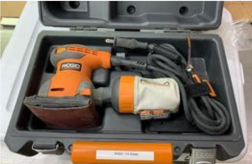
Rigid 1/4 sheet finish sander, like new $25