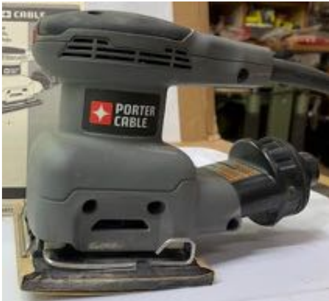
PC 1/4 sheet finish sander, vacuum hose fitting $20