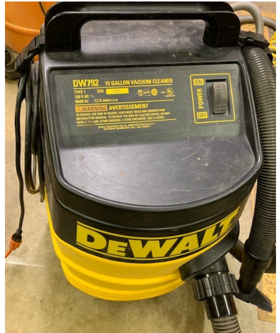
DeWalt 15 gal wet or dry vac. Like new $125