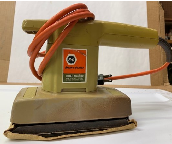
B&D 1/2 sheet finish sander $5