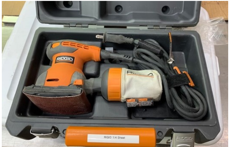
Rigid 1/4 sheet finish sander, like new. $35