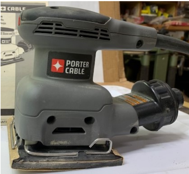
PC 1/4 sheet finish sander, lightly used, vacuum hose fitting $30