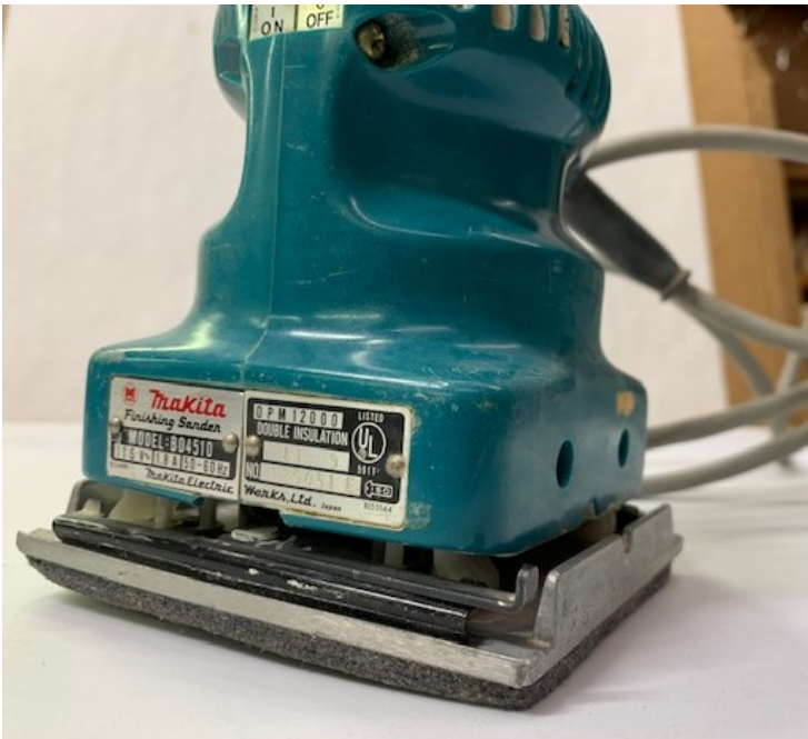
Makita 1/4 sheet finish sander $10