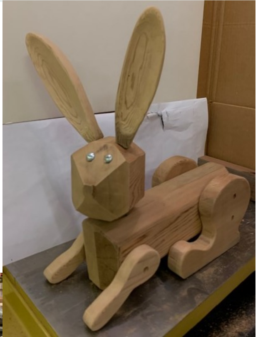
Replacing our old "Guard Rabbit" (Bill Nay)