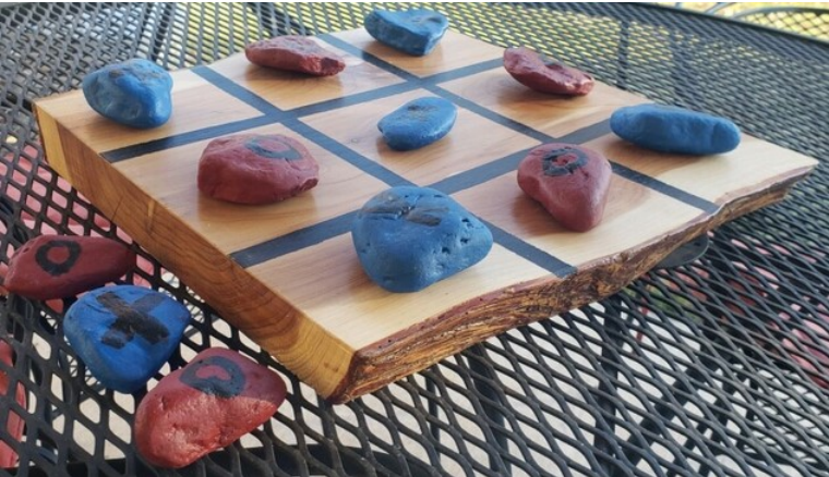
Tic-Tac-Toe games for Christmas gifts.