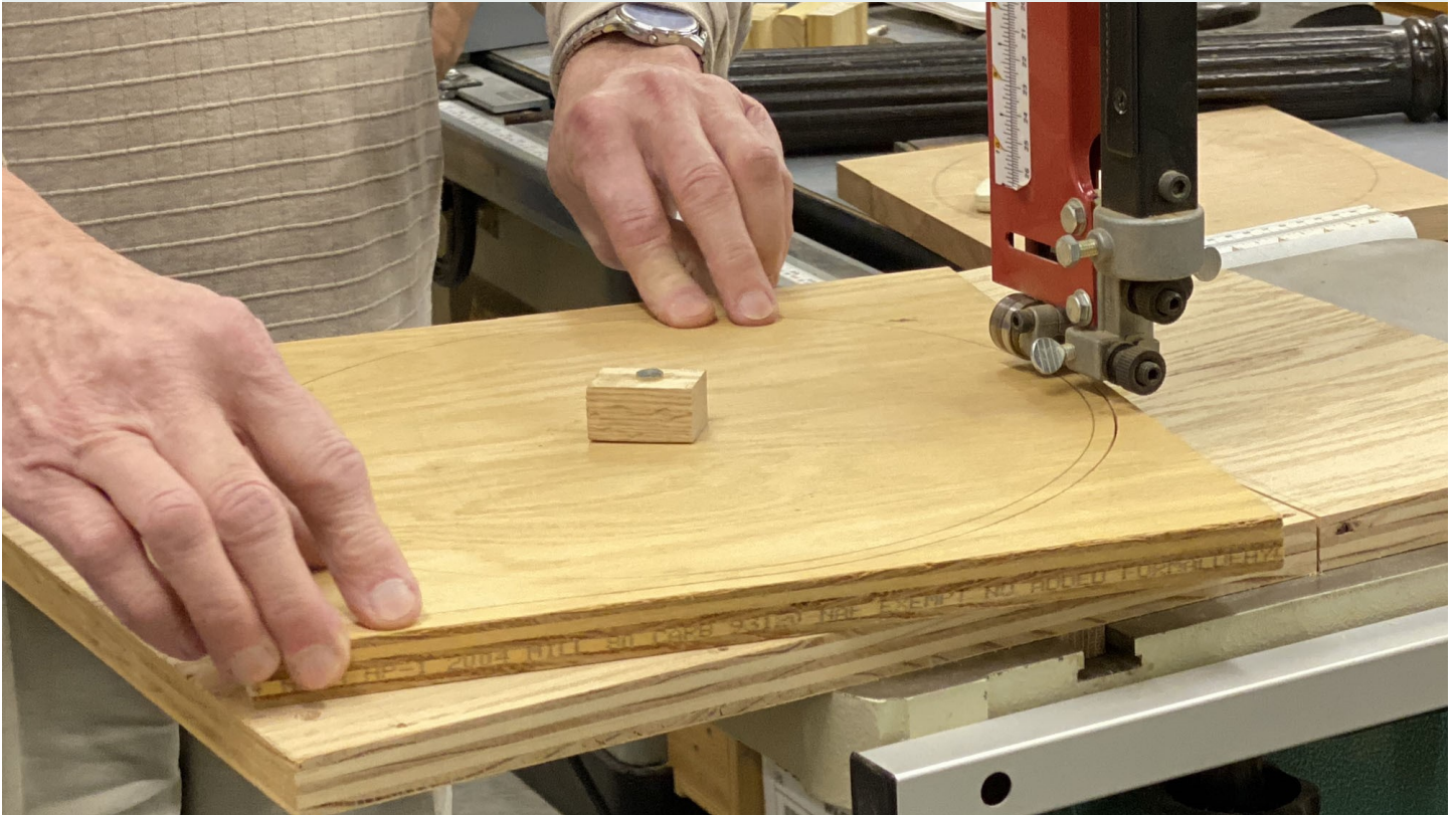
Gregg's cutting board...very nice