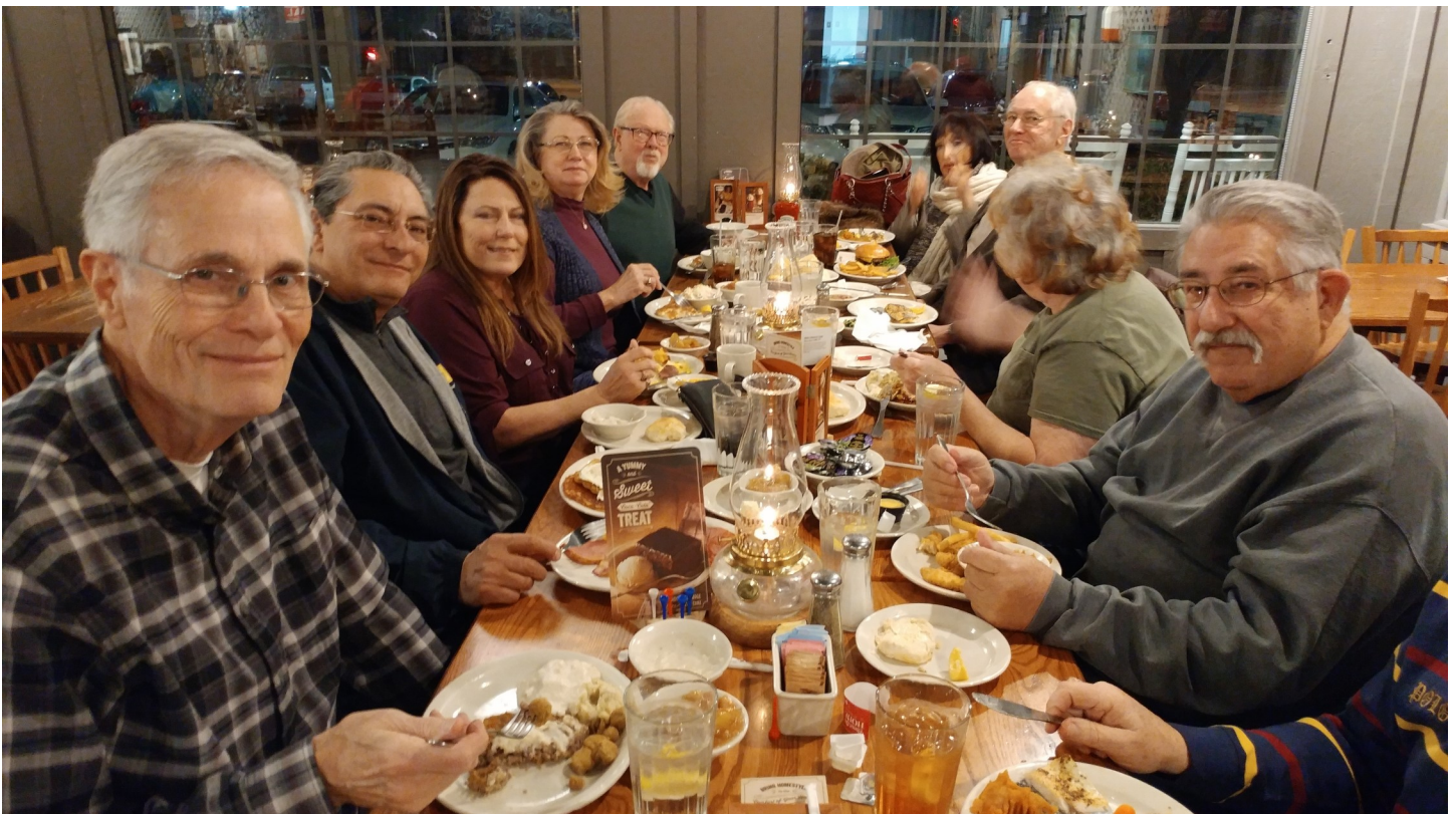
January 20th dinner/social at Cracker Barrel

George Nakashima (1905-1990), woodworker, author of "The Soul of a Tree"