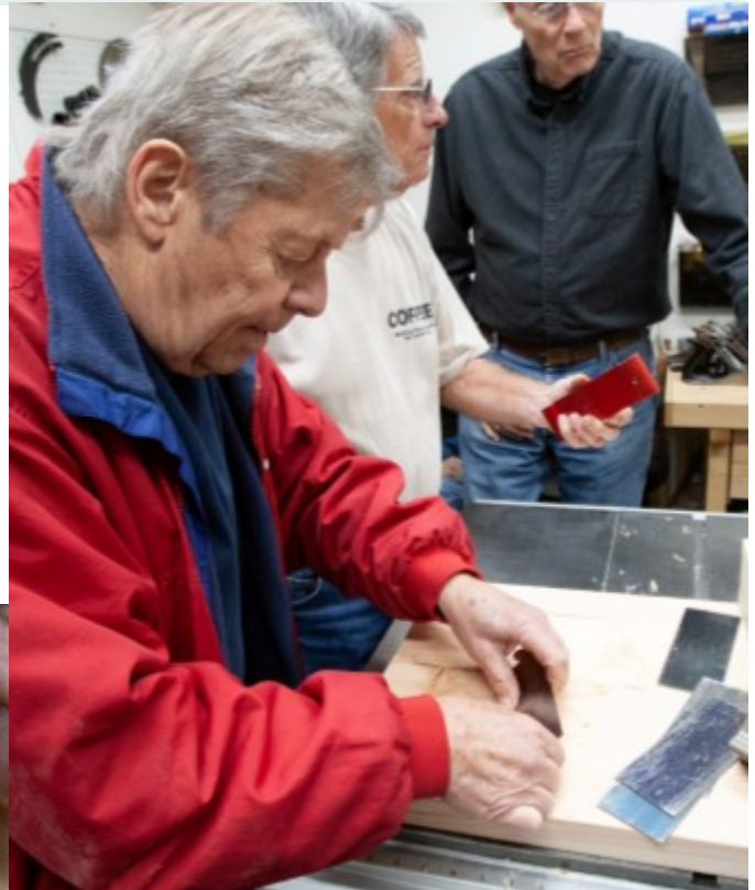
A few members trying out their scraping techniques.