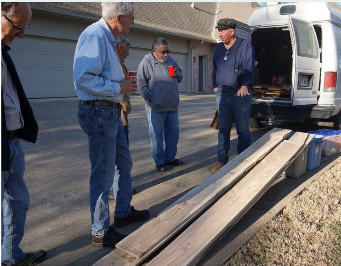
Highly figured swamp oak boards priced at $15 each.