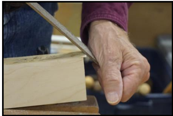
Bill showed the use of a rasp to smooth corners.