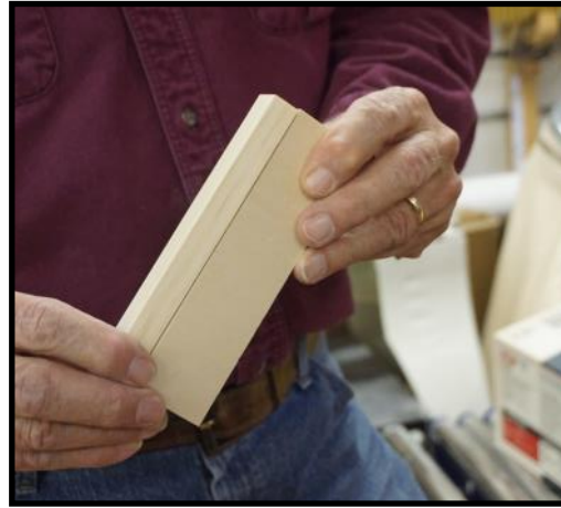
To hide plywood shelf edges, Bill trimmed with hardwood cut to shape on his tablesaw. To attach the banding, he glued, clamped and pin nailed it to the plywood.