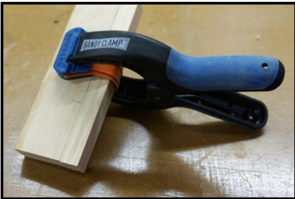
Pictured above is one style of clamp he used to hold the trim fast to the plywood edges.